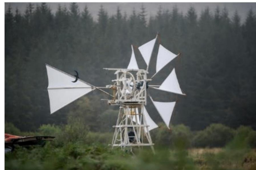
WhiteMill , 2016. Kinetic Art. Mobile, windmill powered machine. Sanctuary Festival, Galloway, Sept 2017