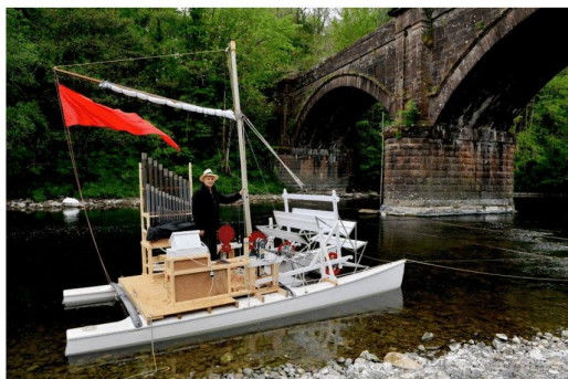
WaterOrgan . Upland Public Art Commission for Spring Fling 2019.